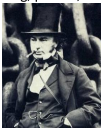
Isambard Kingdom Brunel

This term we are learning about two important historical figures. Your child can choose some of these activities at home to deepen their understanding. They can present their work as drawings, writing, photos, models, videos or as a scrapbook.